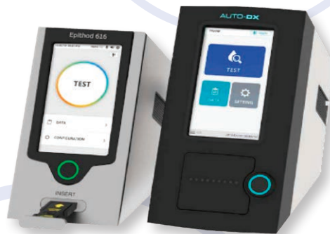
Epithod 616 & AutoDX