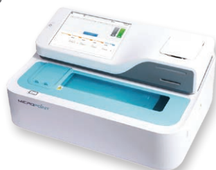
mLab ImmunoMeter & mLabs Smart Meter